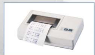
SH-24 dot matrix printer

* Specifications are subject to change without notice.